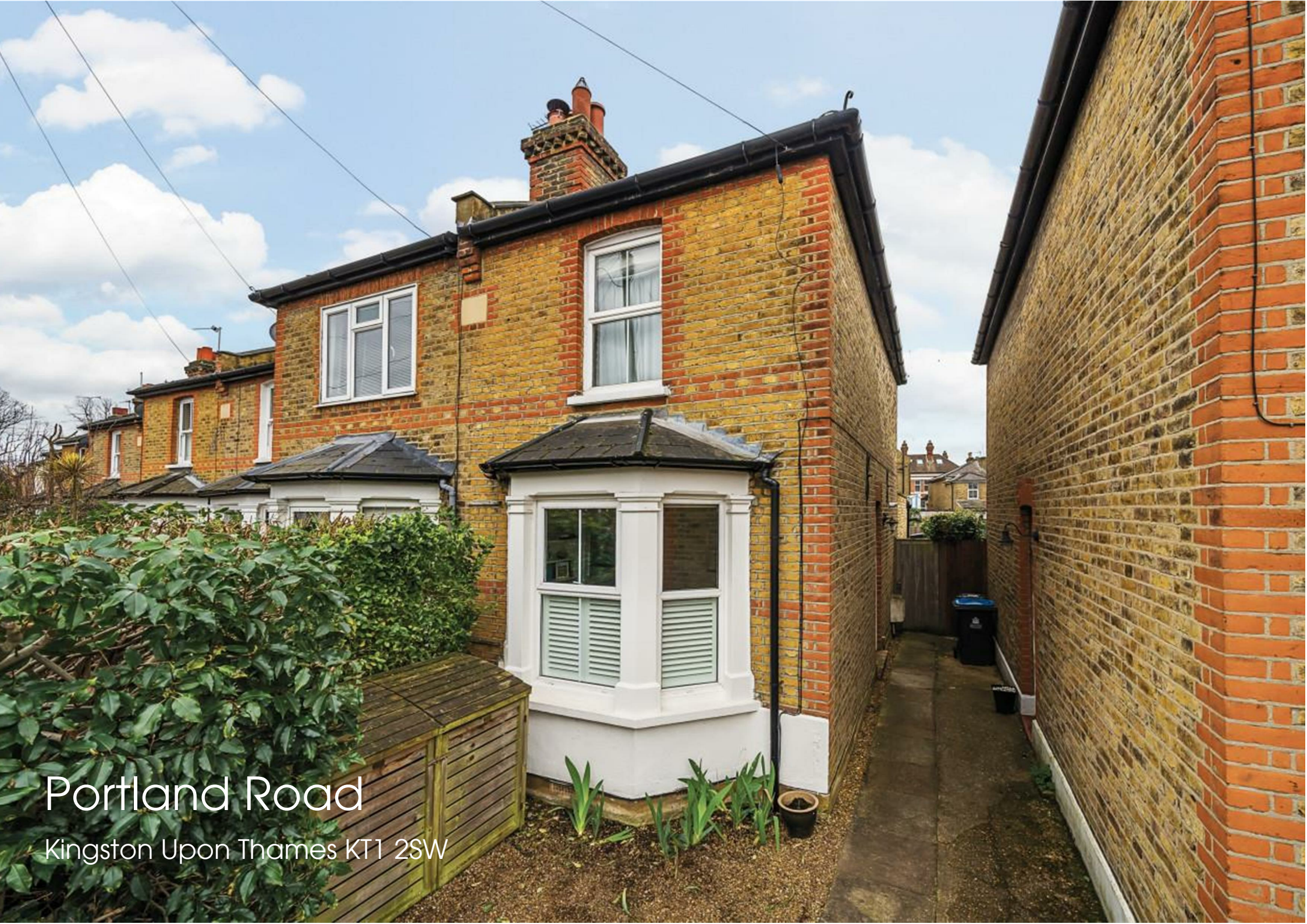
Portland Road Kingston Upon Thames KT1 2SW